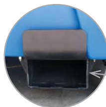
Bottom Mounted Fork Pockets

2 YD Compactor with Standard Pocket Height