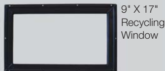
9" X 17" Recycling Window