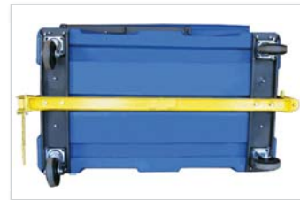
Underside Support Bar