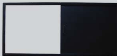
24" X 20" Cardboard Window With Door