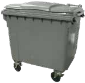
1 1/2 YARD