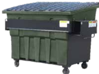
3 YARD FRONT LOAD