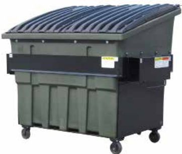
4 YARD FRONT LOAD