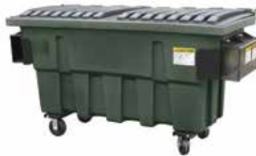
1 YARD FRONT LOAD