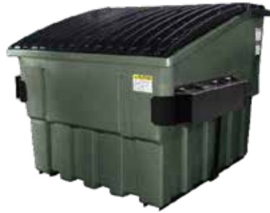
6 YARD FRONT LOAD ST