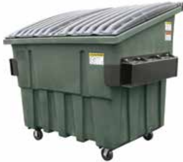
4 YARD FRONT LOAD