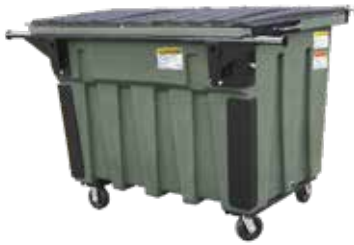
2 YARD REAR LOAD