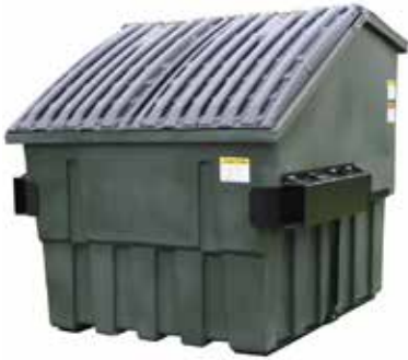
8 YARD FRONT LOAD ST