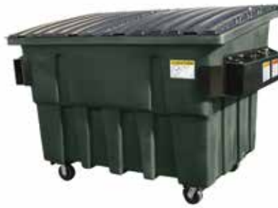
3 YARD FRONT LOAD