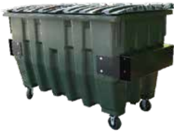
2 YARD FRONT LOAD