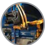
Fully-Automated Side Load

Otto's 25 gallon Edge cart suits existing collection systems. Use fully-automated gripping arms or a semi-automated lifter using a proprietary adapter plate. Small size makes this container ideal for food waste streams.