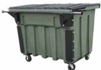
2 YARD REAR LOAD