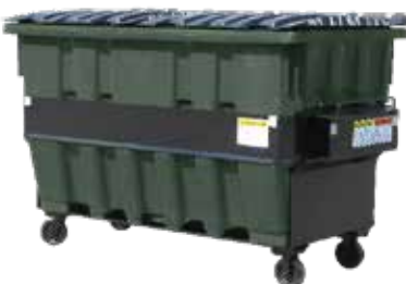
2 YARD FRONT LOAD