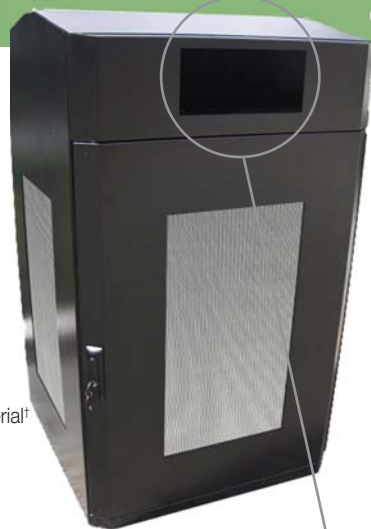
Built-in deflectors on each side direct waste into open cart