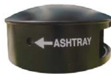
Hidden Smokers Box for cigarette butts