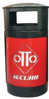
Powder coated steel with laser-cut