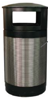
Perforated stainless steel