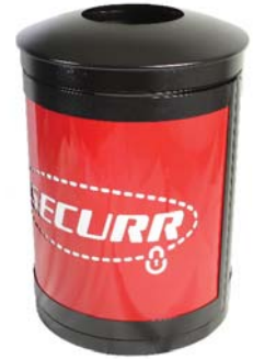
55 Gallon Indoor General Waste