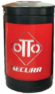
35 Gallon Indoor Beverage