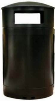
Powder coated steel