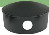
Outdoor Lid— Beverage opening

Lids pictured reflect a sampling of available offerings.