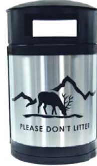
Brushed stainless steel with laser-cut