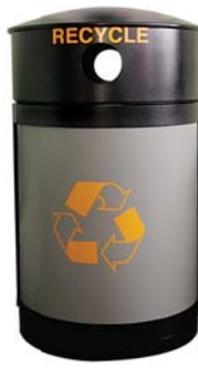
Powder coated steel with vinyl decals