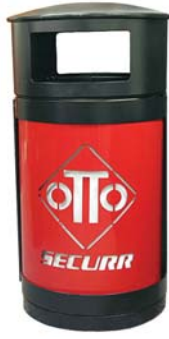
35 Gallon Outdoor General Waste