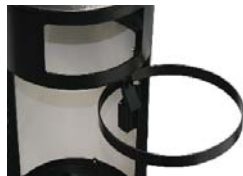
Optional Bag Ring