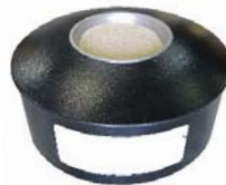
Optional ashtray bowl