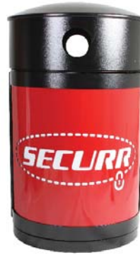
55 Gallon Outdoor Beverage