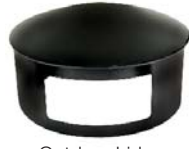
Outdoor Lid— General waste