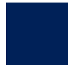
Dark Blue - 68