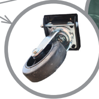
Reinforced caster mount